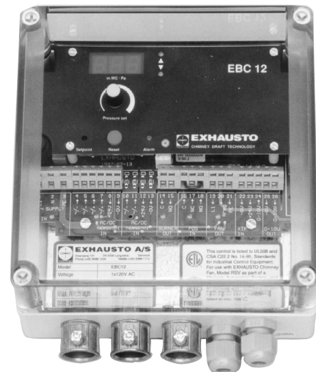
EBC 12 Control Box